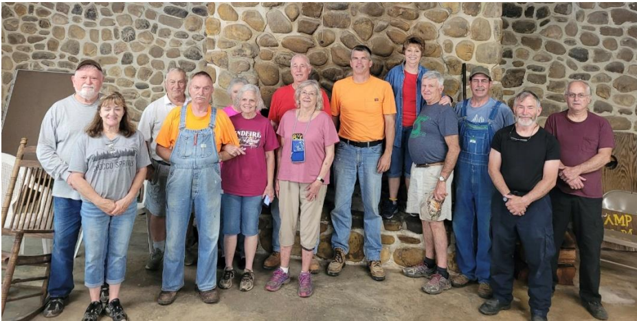
Camp MACOBA May 2023

“My grace is sufficient for you, for my power is made perfect in weakness” 2 Cor 12:9 God says he same thing to you that He said to Paul when He calls you into service for His Kingdom. Perhaps you are feeling the desire or guidance from God to serve on an ALCOM project for His glory. You might feel inadequate or unsure of your skills. Don't let these feelings stop you from serving our Savior. Pray ask God if He wants you to serve and accept His calling. He will make it clear to you and whatever help you can be on a project will be sufficient.