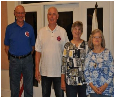
New Officers 2023

Newsletter from the President's Camper.... May 2023